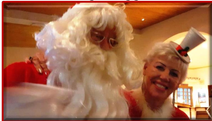
Mr and Mrs Claus