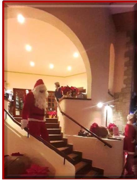
Santa arriving bearing gifts for all