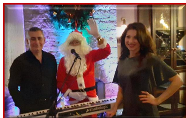
Whitemouse Duo ..... and with Santa!